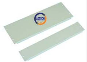
FT-BP01 1U FT-BP02 2U FT-BP04 4U