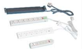
FT-PDU8W 8 way FT-PDU10W 10 way