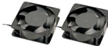
FTL-CF220V 220V FT-CF115V 115V