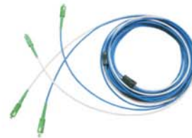
Armored Patch Cord SM Duplex