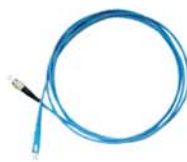
Armored Patch Cord SM Simplex