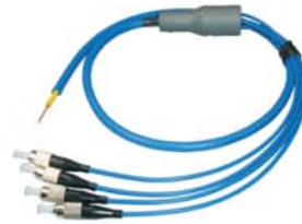
Armored Pigtails, 4 core