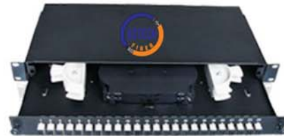
24 port Simplex