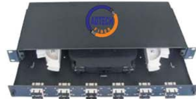
12 port Duplex