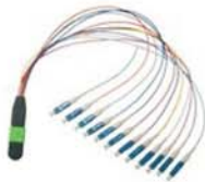
MPO Fan-out patch cord