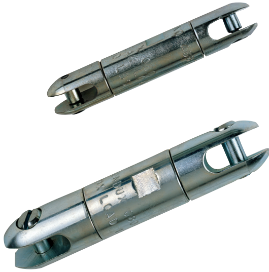
U. S. Patent No. 4,687,365.